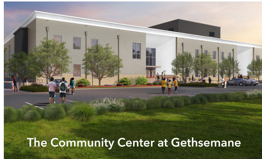
The Community Center at Gethsemane

At places marked * those who are able may stand.